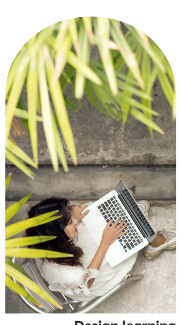
Design learning experiences wherever inspiration strikes.